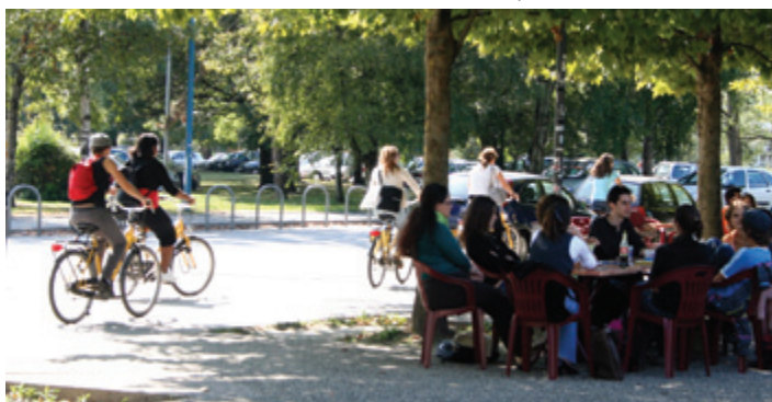
The terrace of the EVE Student Centre, on the main campus

The agency is closed during university vacations and public holidays.