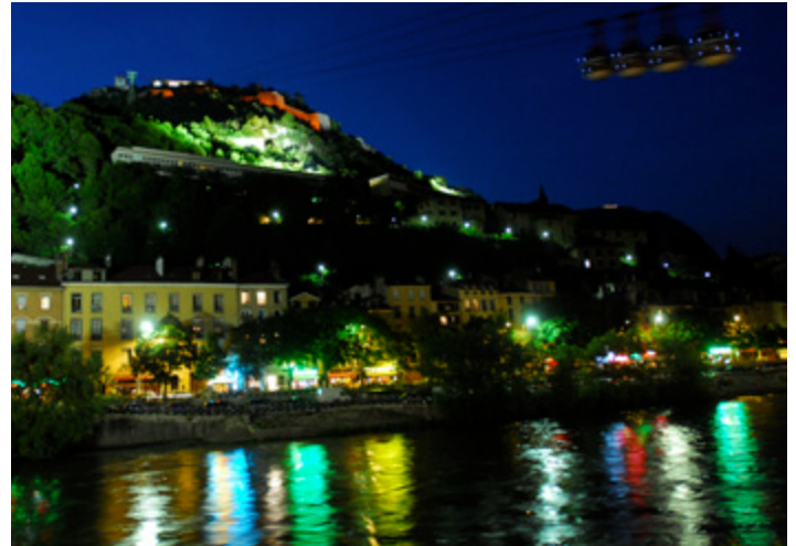
The summit site of the Bastille Fort, overlooking the river Isère and Grenoble