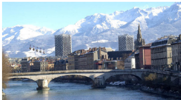
Grenoble - Deck 'Marius Gontard' the river Isère

A student who has not yet found definite accommodation, can while waiting reserve a hotel room via the website of the Grenoble tourist bureau: www.grenoble-tourisme.com or reserve a place at the local youth hostel.