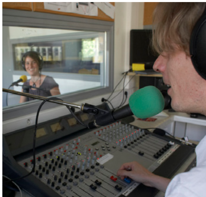
The Campus Radio Station at the EVE Student Centre, on the main campus