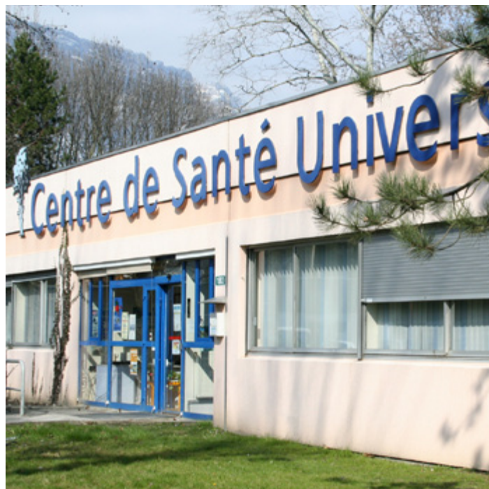
The University Health Centre on the main campus