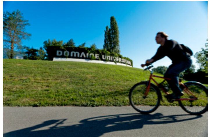
The Entrance to the main campus 'Domaine Universitaire, Saint-Martin-d'Hères/Gières'