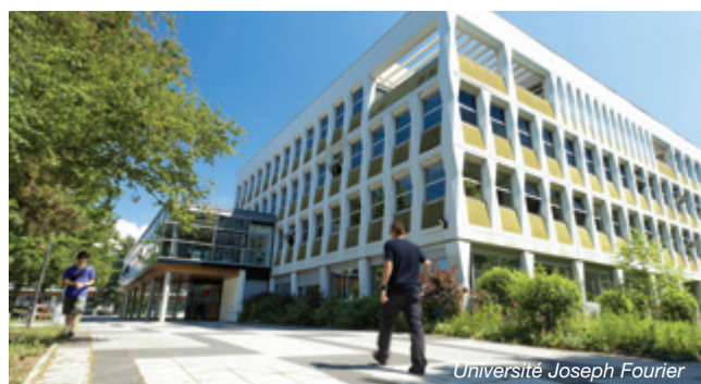
Université Joseph Fourier