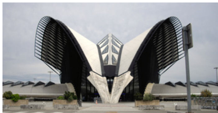
The Lyon-St.Exupéry Airport

www.grenoble-airport.com Shuttle coach service: www.grenoble-altitude.com Return price: 22 €