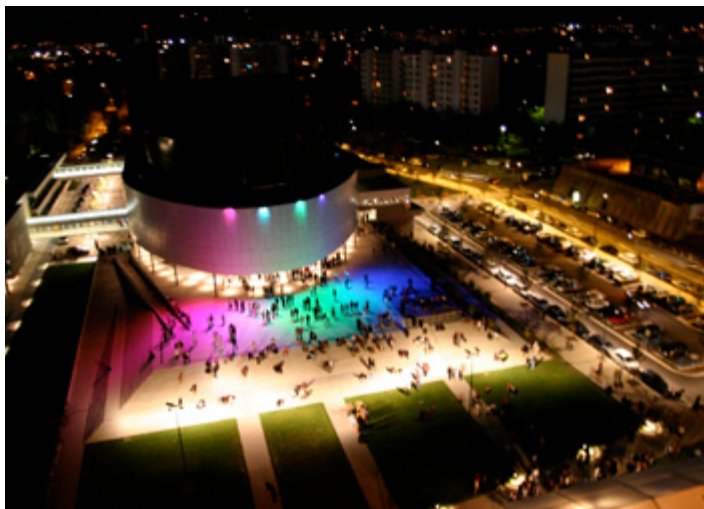
The MC2: the Grenoble 'Maison de la Culture'