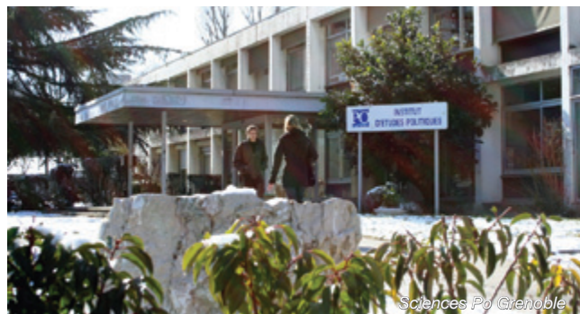
Sciences Po Grenoble